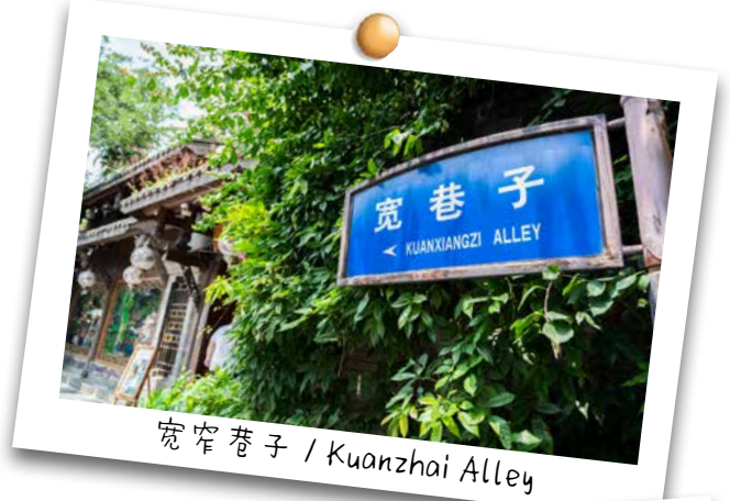
宽窄巷子 / Kuanzhai Alley

体验长江索道 Experience Yangtze River Cableway